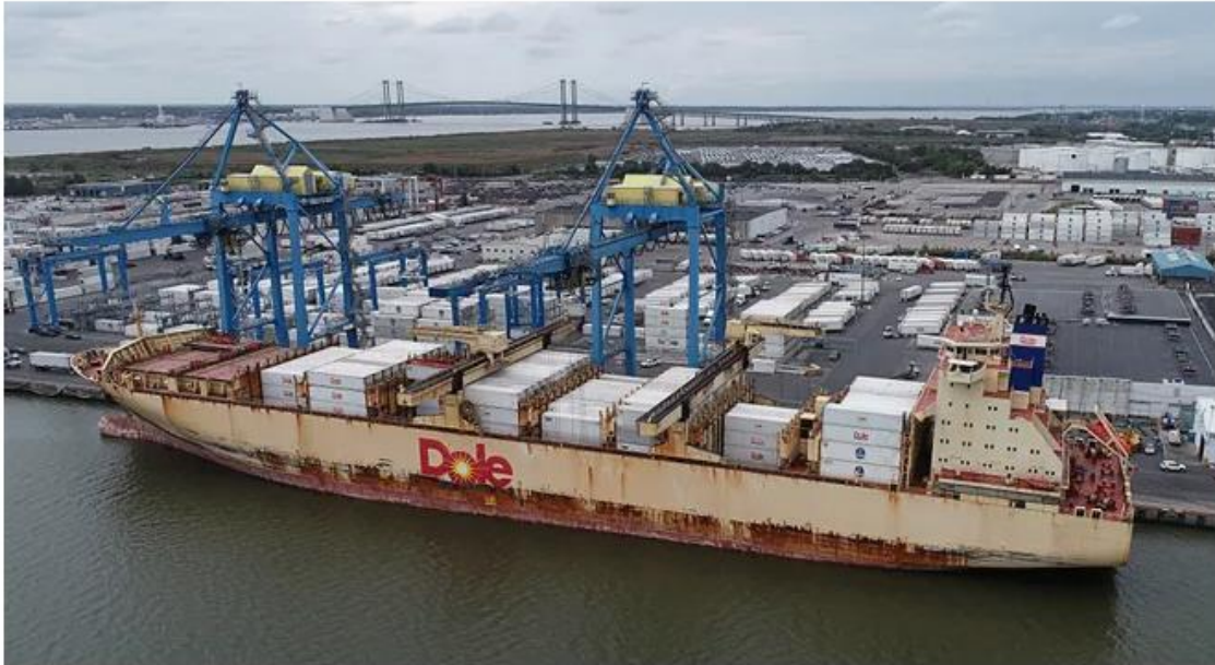
A Dole ship sits docked at the Port of Wilmington on Sept. 23, 2024.

Ideal for industrial companies in need of bulk product storage, the warehouse will be equipped with overhead cranes and include 28-foot-high ceilings.